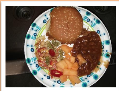
This is my plate, based on the number of QSO's