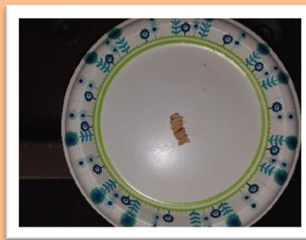
Della's plate, based on the number of QSO's