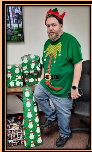
We even had our very own Elf on a Shelf!!