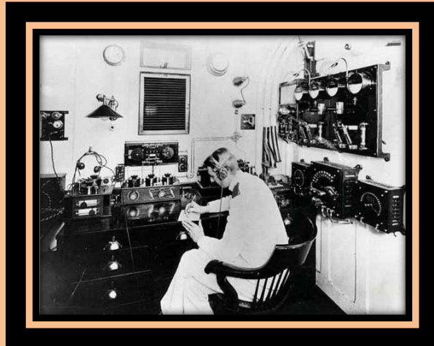
Real Radio from the 1920's

What is the below circuit? And what can it be used for? Send your answers to me bmannings@zitomedia.net